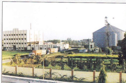
Manufacturing Facilities (Unit-4)