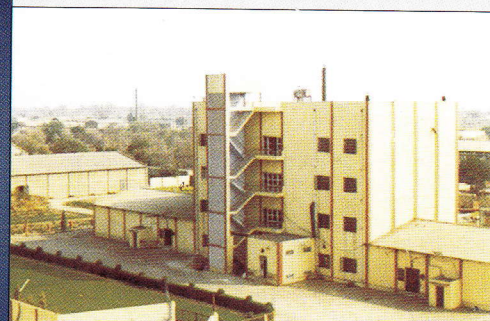
Manufacturing Facilities (Unit-2)