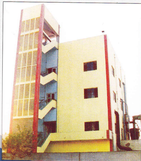
Manufacturing Facilities (Unit-1)