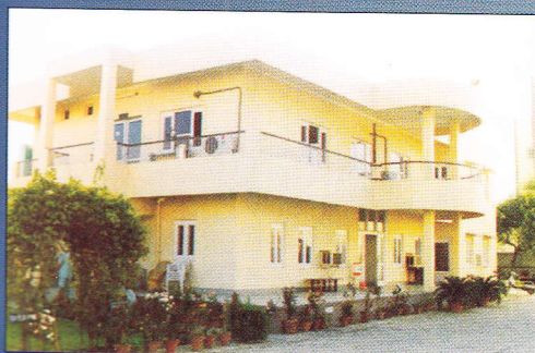
(Application Laboratories & QC Facilities)