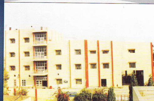
Manufacturing Facilities (Unit-3)